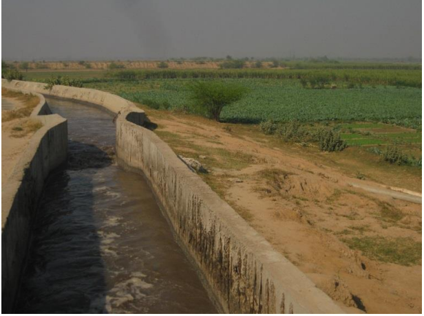
Fig. 1: Municipal wastewater drain passing through the agricultural fields in peri-urban area of Faisalabad for irrigation purpose.

Constant use of such industrial water for growing vegetables may cause bioaccumulation of heavy metals up to toxic levels for health. Heavy metals can enter human bodies through the food chain, consequently causing increased incidence of chronic diseases such as cancer and deformity. (Muller and Anke, 1994). The use of wastewater in agricultural land is a common practice in urban and sub-urban areas of the industrial megacities of Pakistan including Karachi, Lahore and Faisalabad. This is because of the fact that wastewater has nutrients and enhances soil fertility. Hidri et al. (2014) found that the proper management of wastewater for irrigation and regular monitoring of soil health, fertility and quality parameters are essential for successful, safe, and long-term reuse of wastewater for agricultural uses.